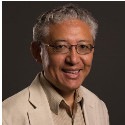
USCIRF Advocate: Commissioner Tenzin Dorjee

Most Tibetans reject this choice, as well as the government's interference in their religious practices. The Chinese government maintains strict control over Tibetan Buddhists, suppressing their cultural and religious practices. Government-led raids on monasteries continue, and Chinese party officials in Tibet infiltrate monasteries with Communist Party propaganda.